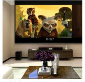
Living room movie