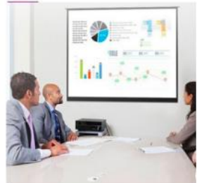
Big screen office